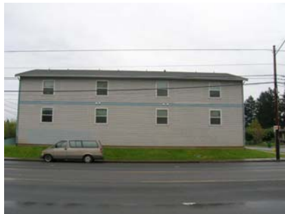
Planning for 122 nd Ave. to create a more convenient, walkable neighborhood ($30,000)