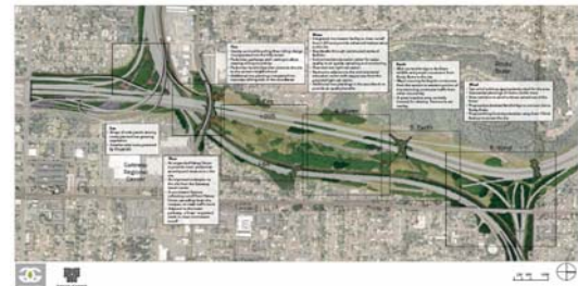
Planning “Gateway Green” (I-205/I-84) development of parks, green space and pedestrian + bikes facilities ($45,000)