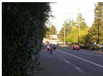
$50,000 initiated a Powell Blvd. Improvement planning project that was matched by a $330,000 ODOT grant