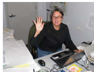
Hired an EPAP Advocate to support project implementation ($125,000)