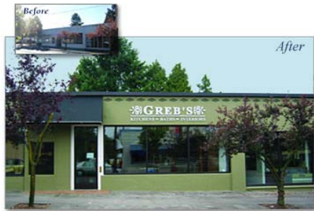
Expanded storefront improvement program for businesses ($115,000)