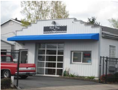
Expanded storefront improvement program for businesses ($115,000)