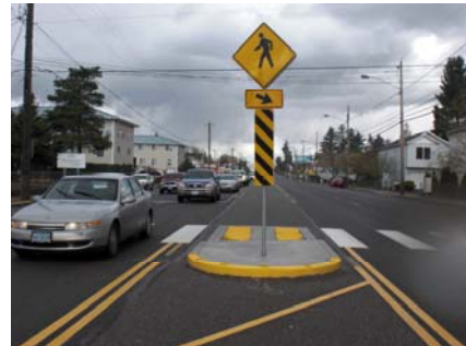
Implemented Safe Routes to School + Traffic Safety improvements ($60,000)