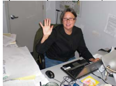
Hired an EPAP Advocate to support project implementation ($125,000)