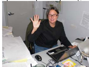
Hired an EPAP Advocate to support project implementation ($125,000)