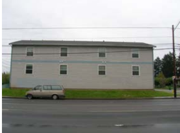
Planning for 122 nd Ave. to create a more convenient, walkable neighborhood ($30,000)