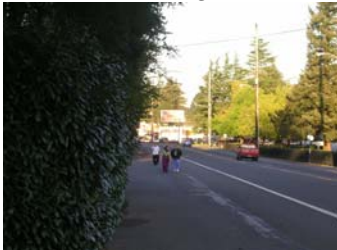
$50,000 initiated a Powell Blvd. Improvement planning project that was matched by a $330,000 ODOT grant