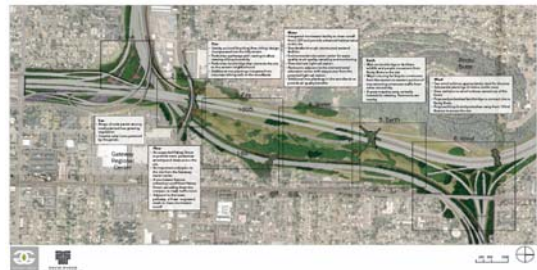
Planning “Gateway Green” (I-205/I-84) development of public space ($45,000)