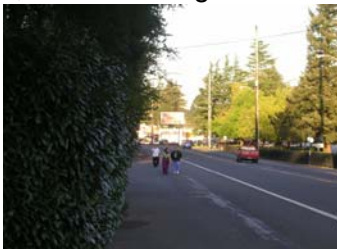
$50,000 initiated a Powell Blvd. Improvement planning project that was matched by a $330,000 ODOT grant